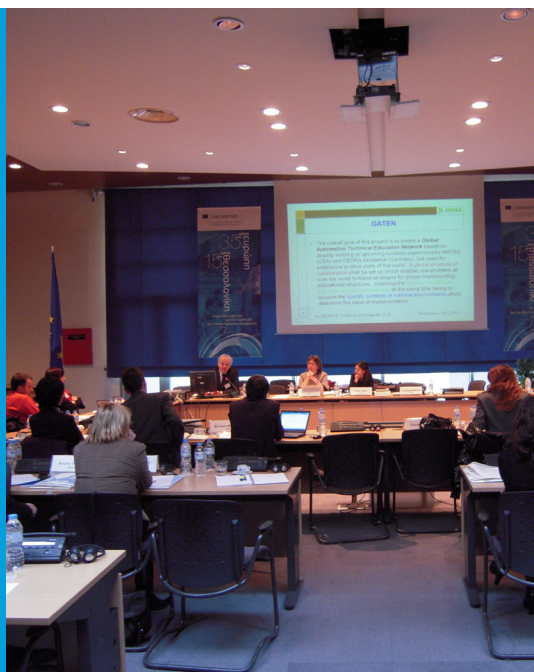
The EQF pilot project workshop held in Thessalonika on the 15 and 16 December 2010

Pilot projects vary a lot in duration and consequently in the applicability of their results. Many efforts have been made to facilitate dissemination and exploitation of the outcomes in order to strengthen their impact at national and European levels. Among the elements that enable them to do this is the role of project promoters, especially the social partners, and their substantial contribution in influencing decisions and policies at national, sectoral and European level. There is evidence that projects with strong social partners' involvement lead to results that are applied at both European and national level. This is evident in work undertaken by pilot projects in hairstressing , where social partners were involved in the development of a sector qualifications and then played an important role in ensuring information was disseminated and that the qualifications were used at a national level. Another critical factor is the active cooperation of national authorities which can follow up the project results with practical implementation measures.